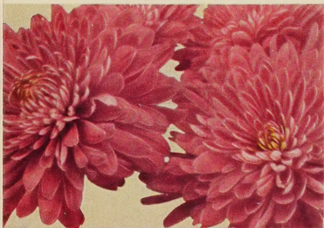
© SEPTEMBER DAWN. 50c each; 3 for $1.25

6 Summer-Blooming MUMS A selection that always beats the early frosts. All early and dependable. 6 Sure-to-Bloom Plants $2.70 (1 of each pictured)